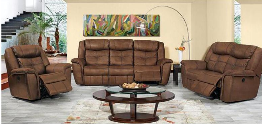
Photo of a Texas lounge suite